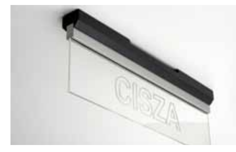
All products subject to change without notice.